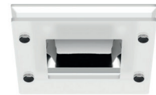
Clear Opal /OPH

A high quality LED downlight with a highly specular reflector and square design creates a refined, flawless look throughout allowing it to be personalised to taste with its different Bezels.